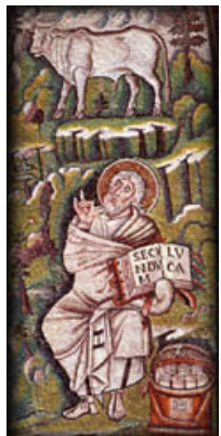
The ox is the symbol for the gospel of Luke